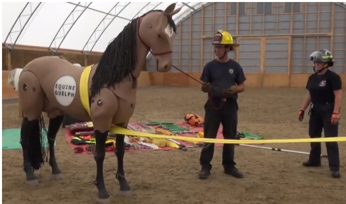
Simple Configuration Forward Assist (Standing)