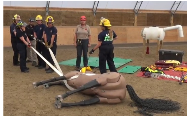
Simple Configuration Forward Assist (Recumbent)