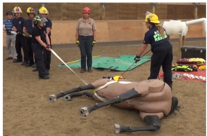
Lark's Foot Configuration Forward Assist