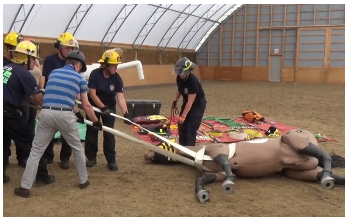
Swiss Seat Configuration Forward Assist (Recumbent)